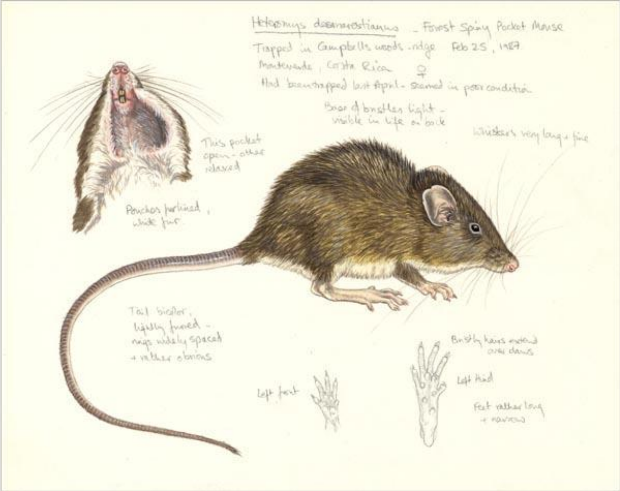
Forest Spiny Pocket Mouse $300