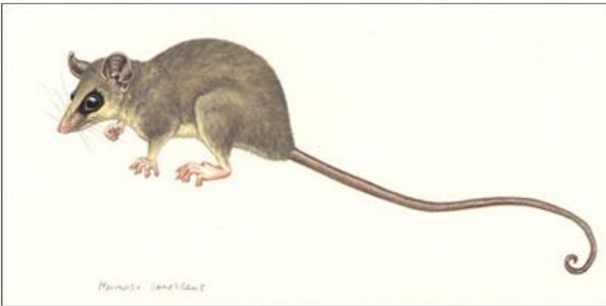
Marmosa (Tlacuacin) canescens $ 100