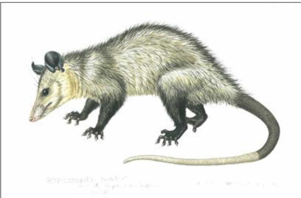
Didelphis $ 200