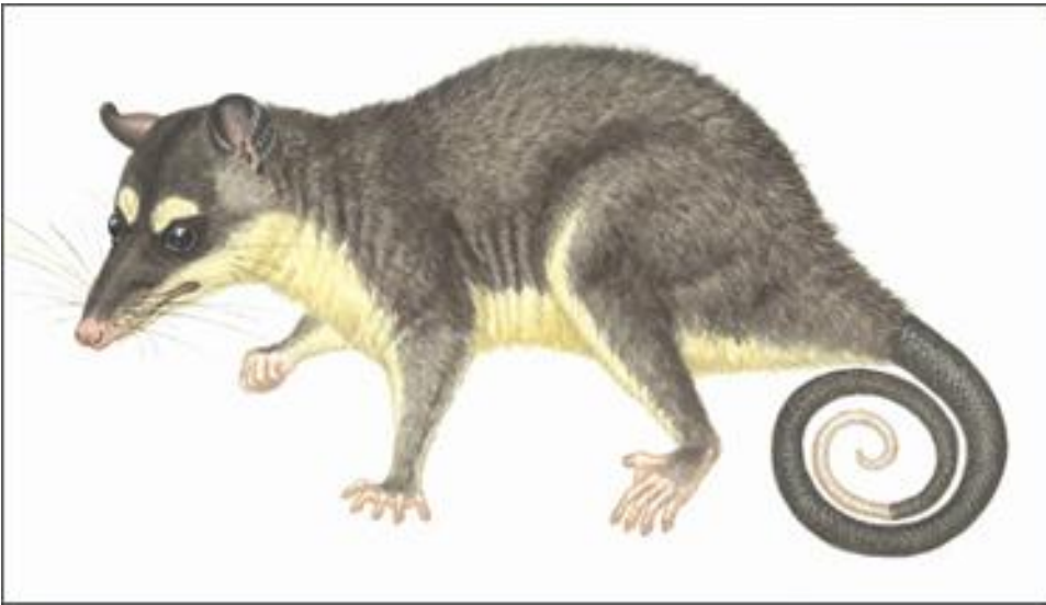
Philander $ 100