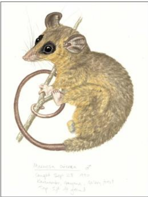
M. cinerea $ 150