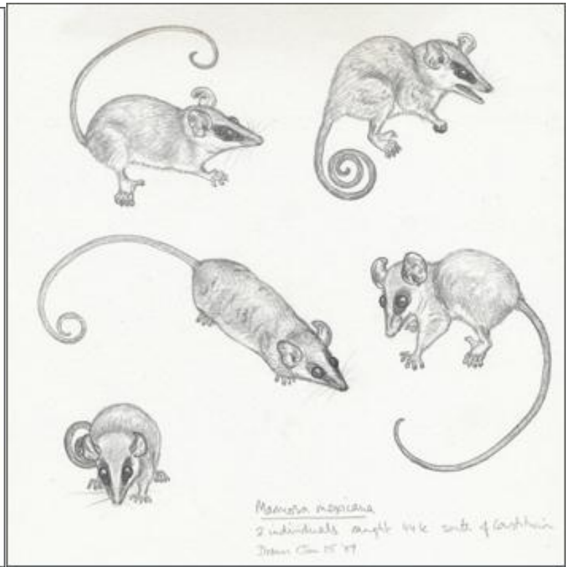
Marmosa studies, pencil $ 150