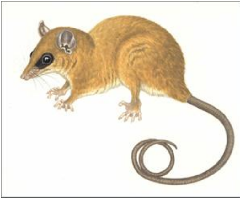
Marmosa zeledoni $ 100